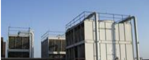
Client: SAUDI ARAMCO - Project: Ras Tera in February 2005 handed over complete job