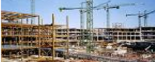
Client: SAUDI ARAMCO - Project: Ras Tera in February 2005 handed over complete job