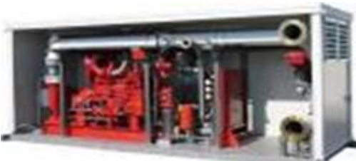
Client: SAUDI ARAMCO - Project: Safety Station at Jeddah 2008, handed over complete job a