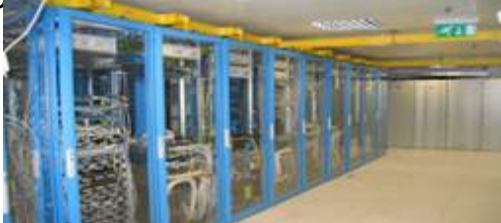
Client: SAUDI ARABIAN PETROLEUM CO. (SAPCO) Project completed in August 1990 Project: Installation of 110KV Disconnected Switchgears, SCECO-E.