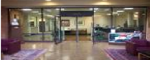
Client: SAUDI ARAMCO - Project: 14, Alotaiba in November 2007