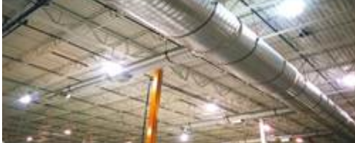
Client: SAUDI ARAMCO - Project: Alotaiba in November 2006 handed over complete job