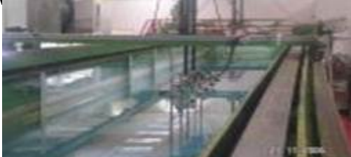
Client: SAUDI ARABIAN PETROLEUM CO. (SAPCO) Project completed in August 2003 Project: Installation of 110KV Disconnected Switchgears, SCECO-E.