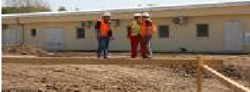
Client: MANHESMAN Project completed in August 1991.