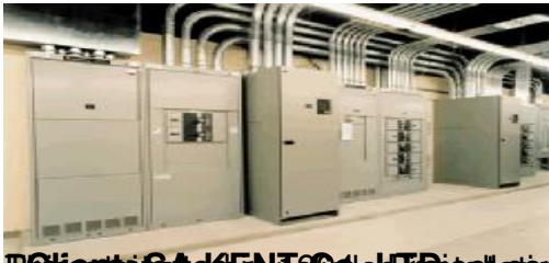
Client: SAUDI ARABIAN PETROLEUM CO. (SAPCO) Project completed in August 1995 Project: Installation of 110KV Disconnected Switchgears, SCECO-E.