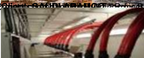
Client: SAUDI ARAMCO - Project: Ras Tera in February 2005 handed over complete job