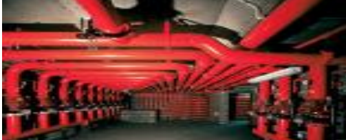
Client: SAUDI ARAMCO - Project: Ucanplegas August 2007